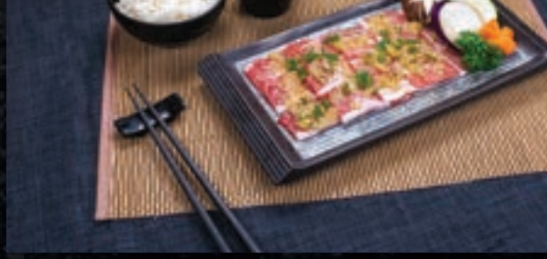
Garlic Butter Beef & Pork Set Pork Belly (30g) Pork Collar (30g) US Shortplate (30g) Beef Ribeye (30g)