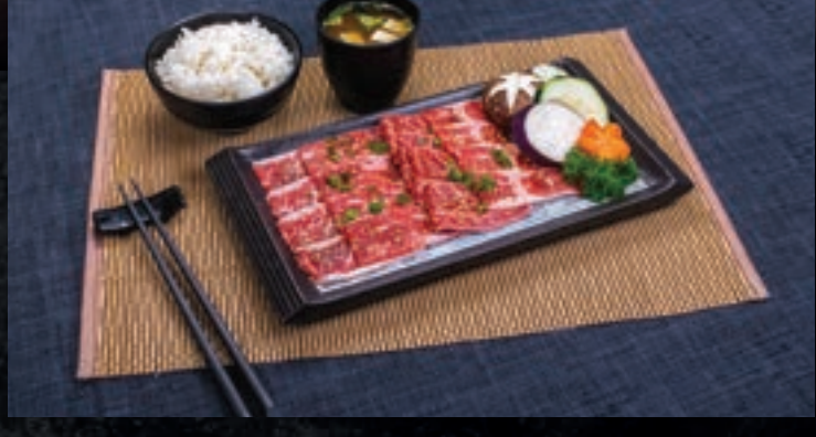
Rocku Australian Wagyu Beef Set Australia Wagyu Shortplate (60g) Australia Wagyu Oysterblade (60g)