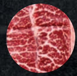
$10.90++ Australia Wagyu Oysterblade (100g)