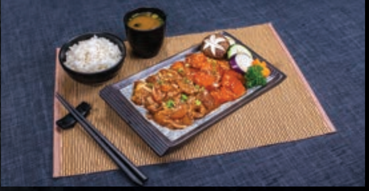
Rocku Teriyaki Set Chicken (80g) Salmon (80g)