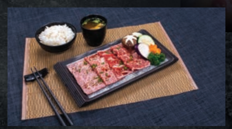
Premium A5 Wagyu Beef Set A5 Hitachi Wagyu Ribeye (30g) A5 Hitachi Wagyu Chuck Flap (30g) Australia Wagyu Shortplate (30g) Australia Wagyu Oysterblade (30g)