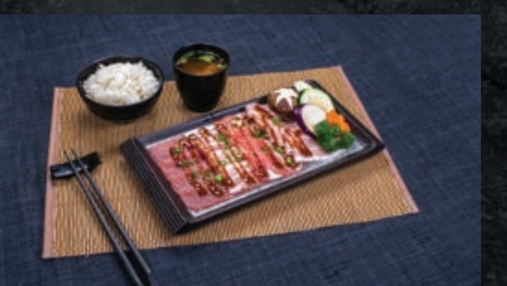
Rocku Miso Pork Set Pork Jowl (30g) Pork Belly (30g) Pork Collar (30g) Pork Loin (30g)