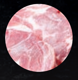
$8,90++ Premium Pork Collar (100g)