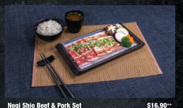
Negi Shio Beef & Pork Set Australia Wagyu Shortplate (60g) Premium Pork Belly (60g)