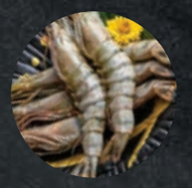
$10.00++ Tiger Prawn (5 pcs)